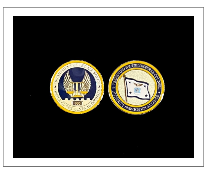
The coin of the General Counsel of the Air Force

You all are in for a treat with this Ethics Flash. It's a cross-over. We teamed up with our esteemed colleagues on SAF/GCA's Fiscal Law team to bring you the lowdown on coins. For months now, questions on coins have been trending. Where does it say I can use appropriated funds (APF) to purchase coins? May I personalize a unit coin? Can I use coins as prizes in a competition? Is it okay to gift a coin to a departing contractor? Then, one of our most ardent supporters