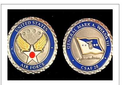
Not an ORF Coin. We just felt bad about including a Navy coin so.....one more for the DAF!

courtesies and only for certain events. In addition, since ORF coins are part of E&EE inventory, they are closely tracked . All ORF coins issued must be